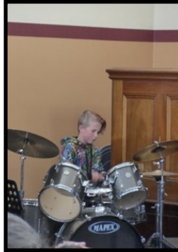
Hunter on drums 2019